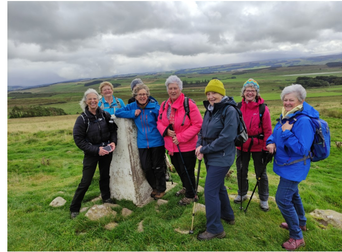
WI members looking windswept on Hadrian's Wall - September 9th